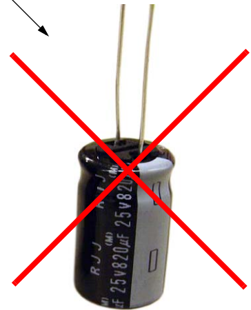
CAPACITOR IN SERVICE MANUAL (1-111-066-11) 820 µF/25V, 105°C (12.8 mm DIAMETER x 20)