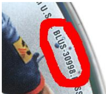
Figure 2.5: Game ID located on the side (border) of the disc (close-up).