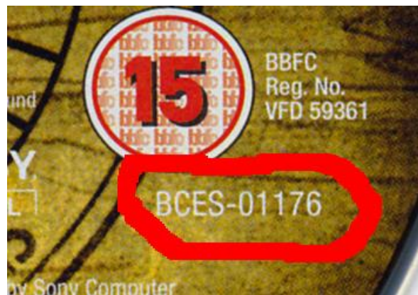
Figure 2.7: Game ID located in the front (general location) of the disc (close-up).