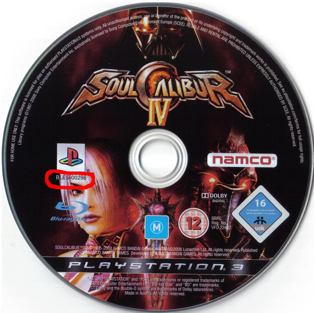
Figure 2.2: Game ID located below PS icon.