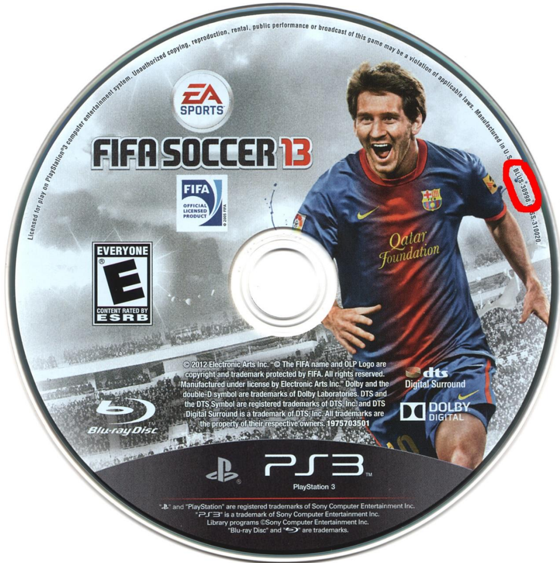
Figure 2.4: Game ID located on the side (border) of the disc.

Game ID located on the side(border) of the Blu-Ray disc: