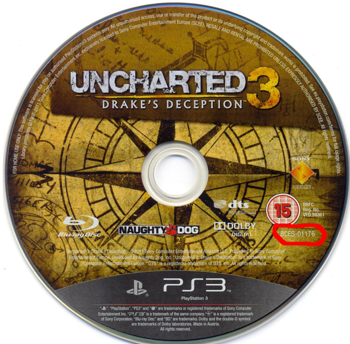
Figure 2.6: Game ID located in the front (general location) of the disc.

Game ID located in the front (general location) of the Blu-Ray Disc: