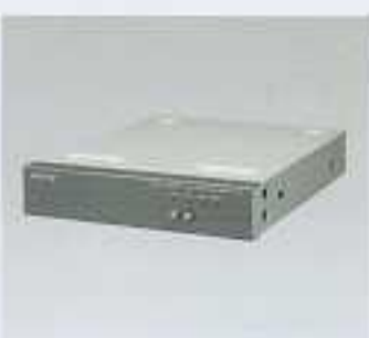
Composite digital monitor interface DMIF-2000