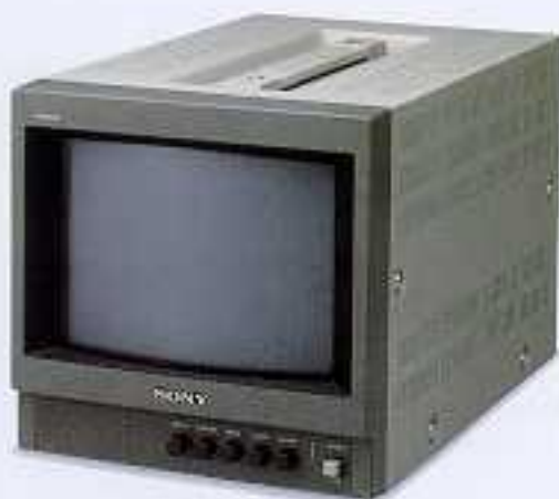
PVM-8040 For basic monitoring device