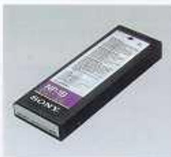
Rechargeable battery pack NP-1B*