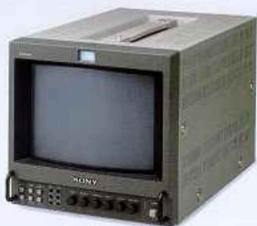
PVM-8041Q For multi-purpose use in various applications