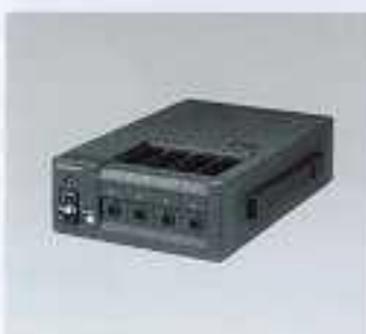
Battery charger for four NP-1Bs and four BP-90As BC-410