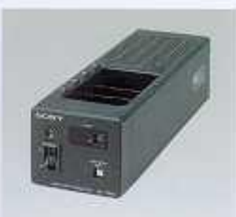
Battery charger for four NP-1Bs BC-1WD