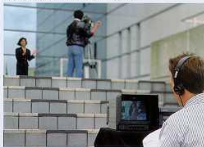
*Applicable for PVM-8044Q/8041Q only.

The optional VF-505 ENG kit contains a monitor hood and cord reel for the PVM-8044Q/8041Q monitors for operational convenience in the field.