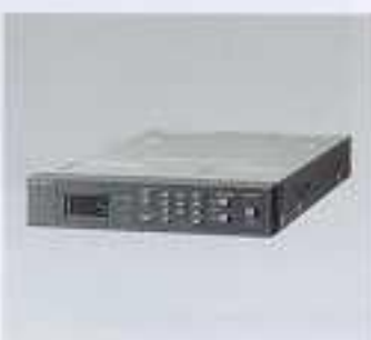
TV tuner unit TU-1040