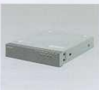
Component digital monitor interface DMIF-1000*