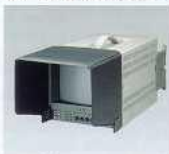
Monitor ENG kit (Monitor hood & cord reel) VF-505*