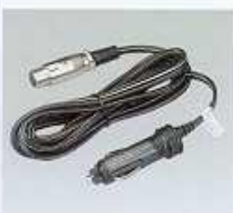
Car battery cord DCC-XLR4*