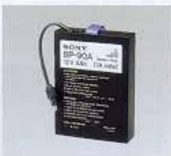
Rechargeable battery pack BP-90A*