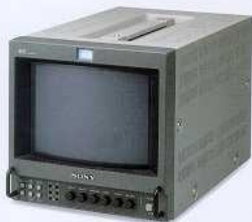
PVM-8044Q Ideal for picture evaluation in studio, ENG/EFP applications

Whether the requirement is picture evaluation or basic picture viewing, the PVM 8-inch series provides the superb picture quality with the facilities that you need.