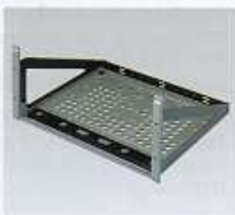
Rack-mounting bracket MB-507