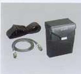
Battery case for BP-90A DC-210