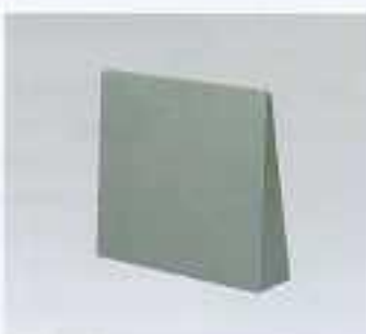
Blank panel MB-509