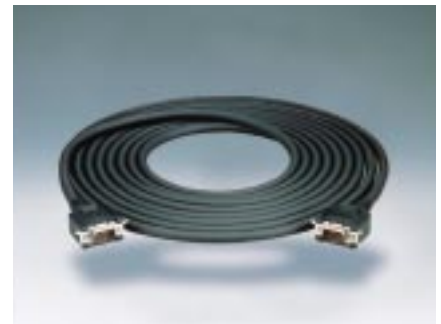
RCC-5G/10G/30G, 9-pin Cable for RS-485/422 Serial Remote Control