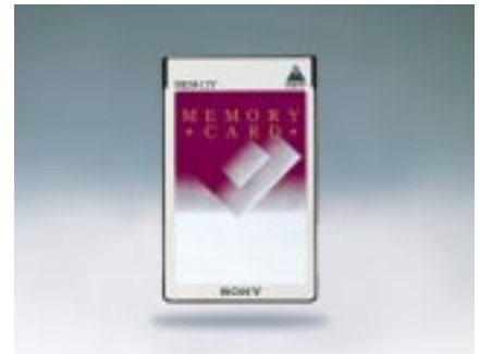
BKM-12Y, Memory Card