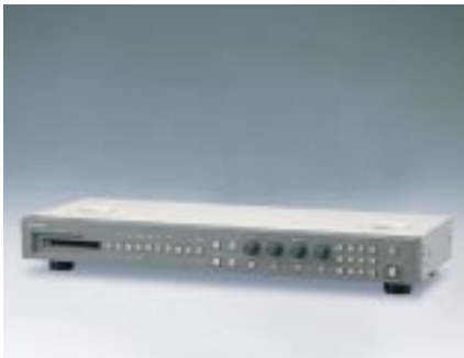
BKM-10R, Central Control Unit