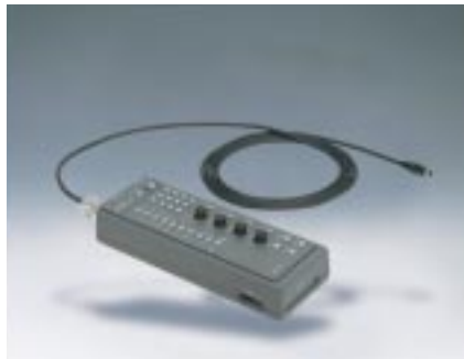
BKM-11R, Hand-held Control Unit