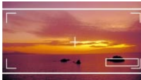
Cross marker + Safe title + Aspect marker