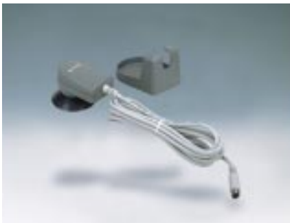
BKM-14L, Auto Set-up Probe