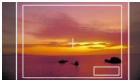
Cross marker + Safe title + 4:3 area marker + Semi-transparent matte