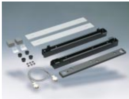
BKM-34H, Control Unit Attachment Kit for BKM-10R with 24-inch Monitor (viewable area, measured diagonally)