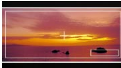
Cross marker + Safe title + Aspect marker + Full black matte