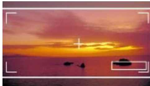
Cross marker + Safe title + Aspect marker + Semi-transparent matte